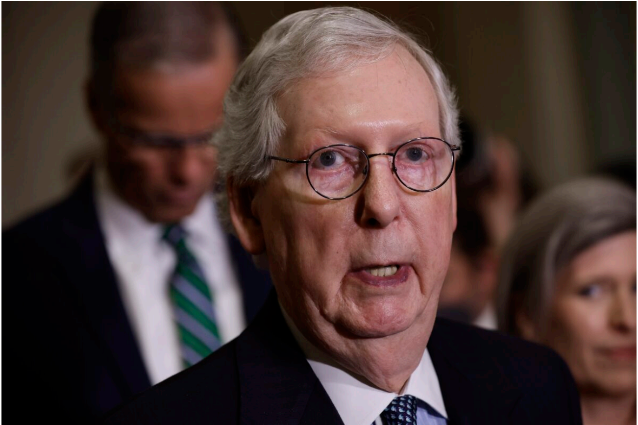
Senate Minority Leader Mitch McConnell (R-Ky.) speaks to reporters in Washington on April 26, 2022.

Assistant Republican Floor Leader and Republican Whip: John Thune (R-S.D.) fills this second-ranking leadership position. His primary job is counting votes and persuading Republican senators to support the Republican Conference's position on all votes.