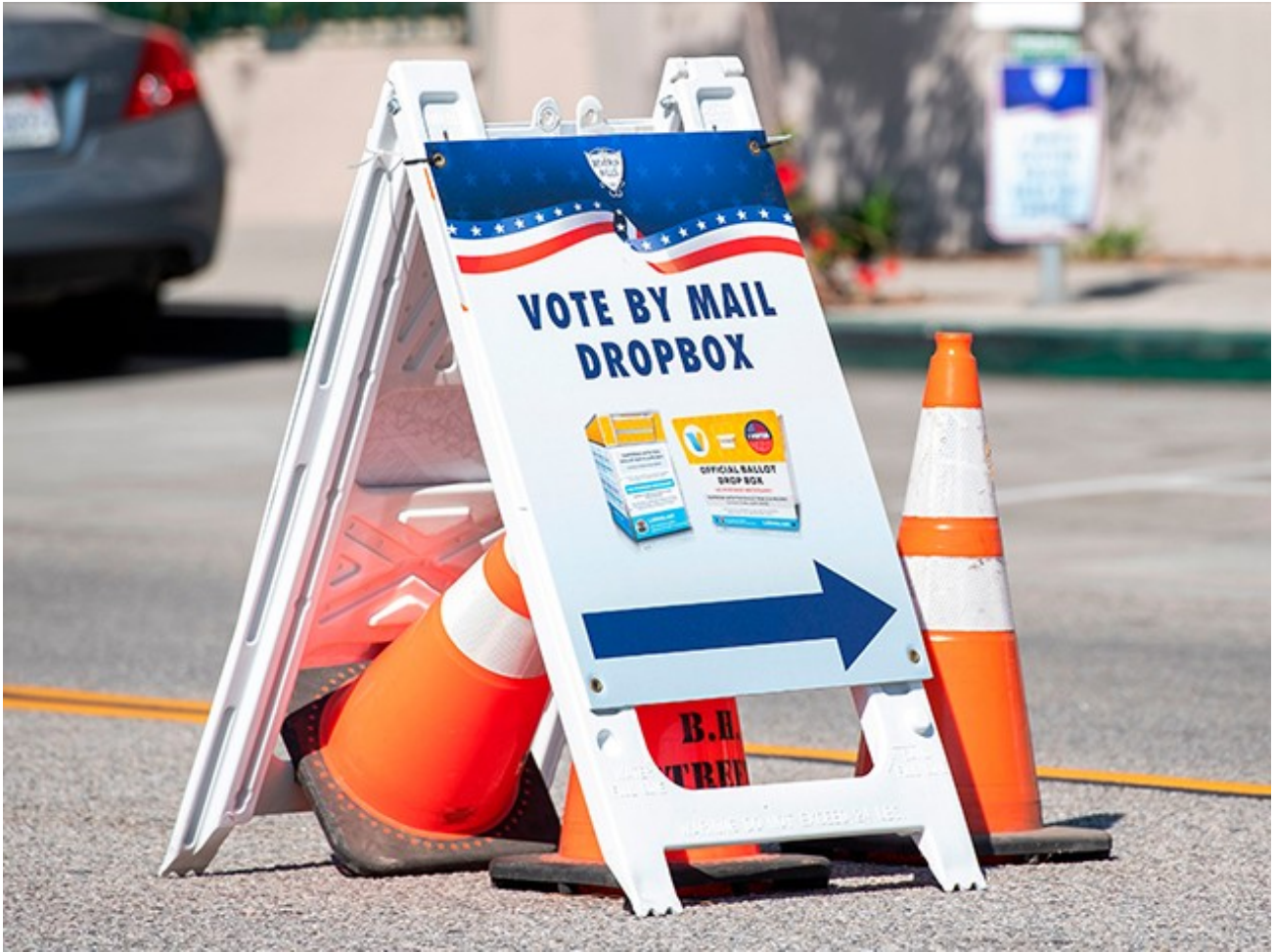
A sign points to a vote by mail dropbox outside Beverly Hills City Hall, October 27, 2020, in Beverly Hills, California.

This is considerably less than the more than $300 million the CTCL poured into bolstering mail-in ballot operations across key states in 2020.